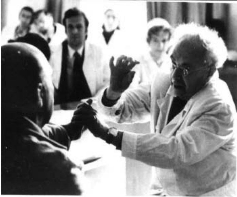
Figure 2. A.R. Luria, assessing a patient.

one hand, a definite kind of functioning of the working brain, provided by neural networks of a certain brain area; on the other hand, a factor has a psychological meaning, and it is an important constituent of a psychological functional system. The disturbance of the factor leads to the appearance of a definite syndrome — a systematic constellation of symptoms. A syndrome (factor) analysis is an analysis of observed symptoms with the goal of finding a common base (factor), which explains their origin. It supposes a stepwise procedure that includes the comparison of all observed symptoms, a qualitative estimation of symptoms, a discovery of their common base, i.e., detecting a primary deficit, its systemic consequences and compensatory reorganization.